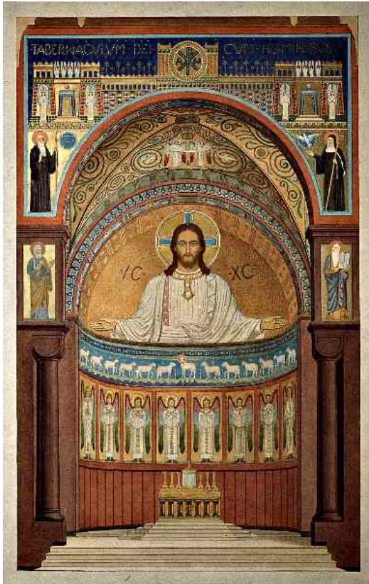
Christ as Pantocrator, Abbey of St. Hildegard, Rudesheim, Rhein, Germany