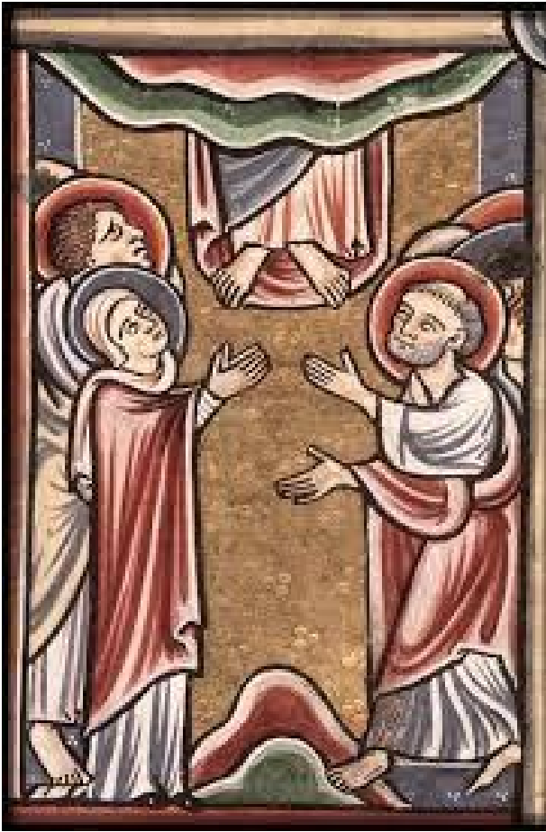
The Ascension, c. 1190-1200