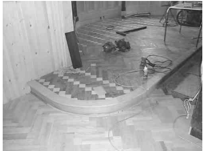
Restored Oak Chancel floor with some new nosing and risers.