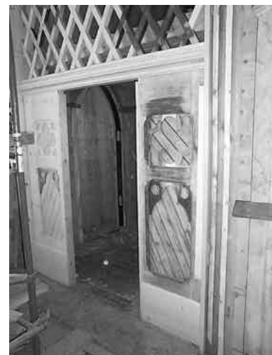
Newly restored Sacristy panels and organ screen.