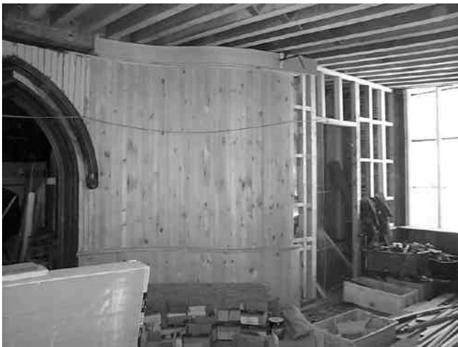
Newly constructed tongue & groove pine curved wall located at the entrance of the church along the north side.