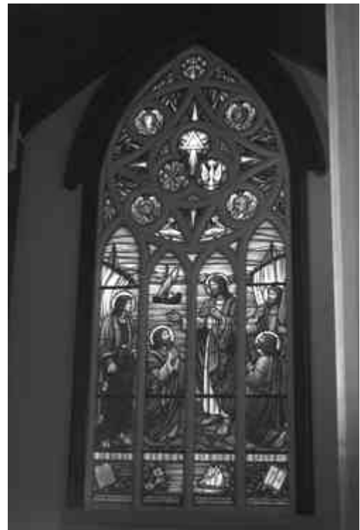
Newly restored "Fishers of Men" window.