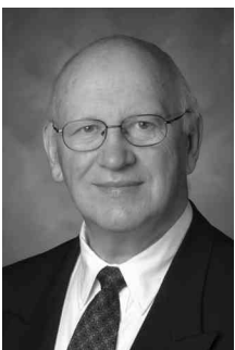
Ben C. Smith Construction Chair